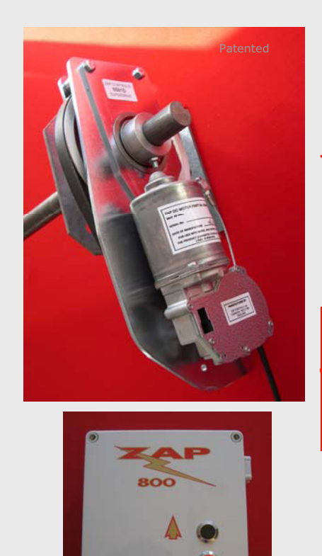
Not For Use In Residential Applications

tech@zap-uk.com www.zap-uk.com 931-510-4432 www.zap-uk.com 931-510-4432 Elsewhere in the world 011-44-154-387-9444