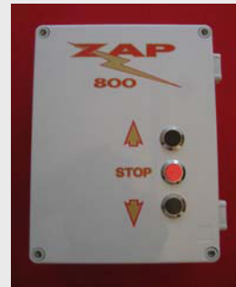
Not For Use In Residential Applications

ZAP Controls Model 825-3-SS DC Commercial Rolling Sheet Door Operator Commercial Operators that use SafetySense™